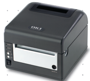
Direct Thermal Label Printers