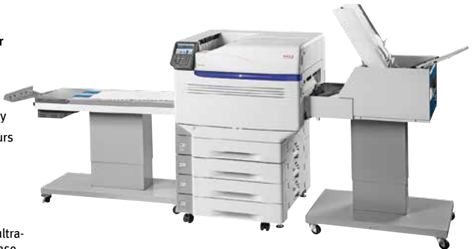
Shown: Pro9542DP+ Envelope Print System (Printer/Feeder/Conveyor/LCF). Also available: Pro9541DP+ and Pro9431DP+ systems.