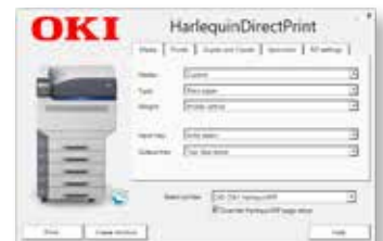
Harlequin DirectPrint RIP

PANTONE ® libraries are included in the Harlequin DirectPrint RIP, to ensure accurate colour matching job to job. For details on the optional RIPs, please contact your OKI representative.