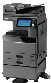
ES9466 MFP with DSDF and Cabinet