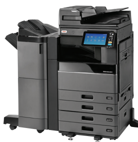
ES9466 MFP with DSDF, PFP, Drawer Module, Multi-Stapling Finisher and Hole punch Unit installed