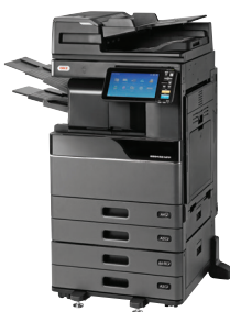
ES9466 MFP with DSDF, PFP, Drawer Module and Inner Finisher installed