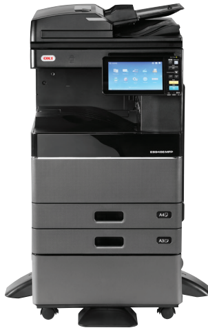
ES9466 MFP with RADF and Cabinet