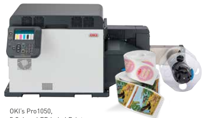
OKI's Pro1050, 5 Colour LED Label Printer

Kenny Couch is optimistic saying “We can offer so much more with the OKI Label Printer in place, and for our customers we have become a “One Stop” solution with time savings over competitors.”