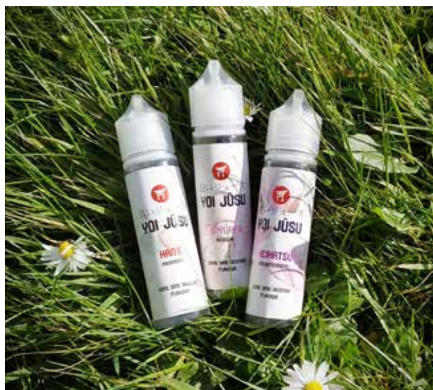
The OKI Pro1050 Label Printer helps Cornish Liquids produce professional labels for their own and their clients' products.