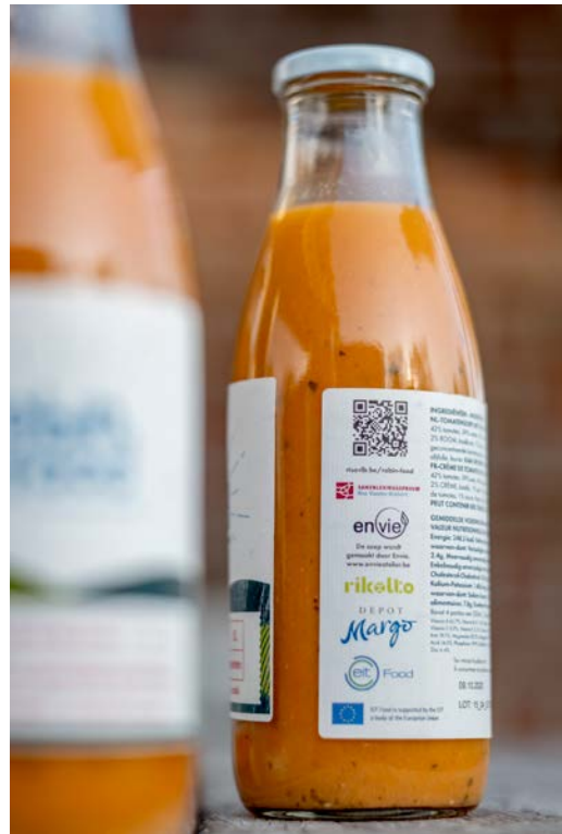
A bottle of soup produced & labelled by enVie for the Robin Food project.