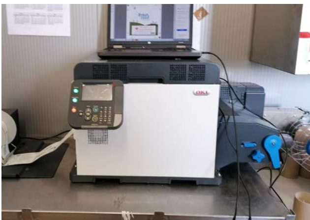
OKI's Pro1050 Label Printer printing bottle labels.

In reaction to the COVID-19 pandemic, enVie, alongside various other organisations, launched the 'Robin Food' project to transform food surpluses into healthy sustainable foods that are made accessible to vulnerable people and families during the crisis. This created a greater and more urgent demand for labels.