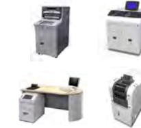
Financial institutions Branch office/Centralized administration systems (ATMs, Smart Cash Station, branch terminals, cash processing machines, etc.) Web and mobile applications Network solutions (video surveillance, network security)