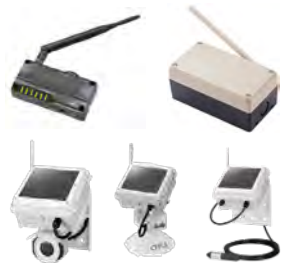
Edge devices 920MHz band multi-hop wireless systems and Zero Energy IoT series