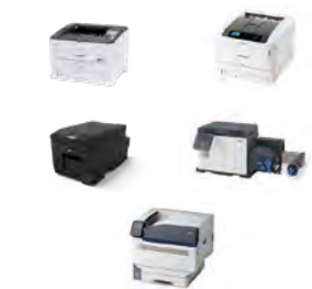
Printers Various monochrome and color printers, compact ticket and label printers, as well as specialized high-speed spot color printers, etc.