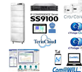
Business communications Contact centers, PBX and business phones