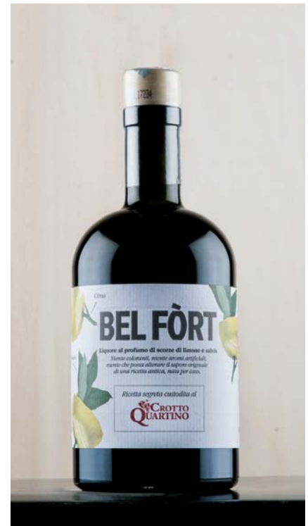
Bottle labels printed on OKI's Pro1050