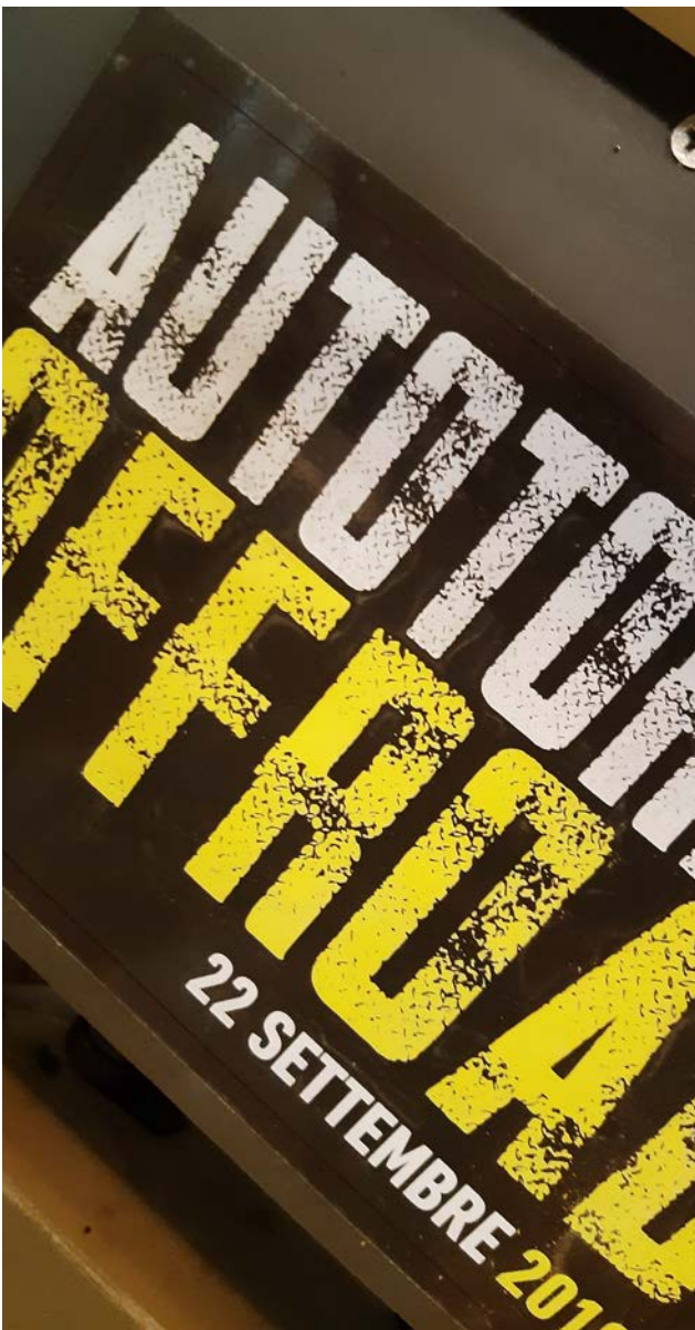
White on transparent media printed using OKI's Pro1050 5 Colour Label Printer.

Enzo Salvato, Owner, Grafiche Morbegnesi