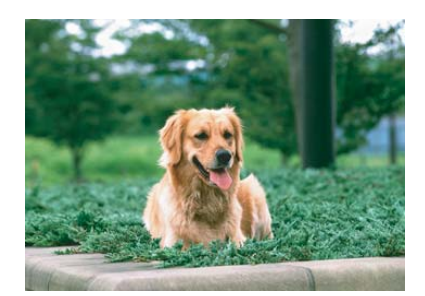
(a) Original image

The use of images incorporating spectral information for each pixel of an image, in other words multi-spectral image attracts attention. This multi-spectral image is able to reproduce color information that cannot adequately be