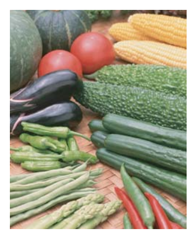
(a) Original image

Fig. 4 (b) shows an image with a lesser burden on the human eye for individual depicted objects and an image comfortably perceived.