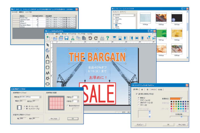
Fig. 5 User interface of "Inhouse Signage Application" (Ofisu-no Kanban-yasan)

The Inhouse Signage Application (Ofisu-no Kanbanyasan) is briefly explained.