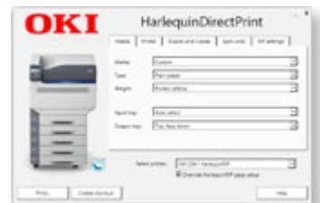
Harlequin MultiRIP 10