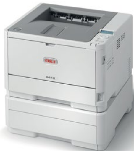
With optional 530-sheet 2nd paper tray