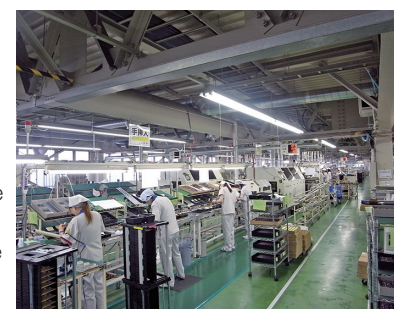
OTPS production lines working toward production reforms

production lead-time, which were promoted through the collaboration of design and sales divisions. A significant reduction in power consumption was made possible through the implementation of these reforms.