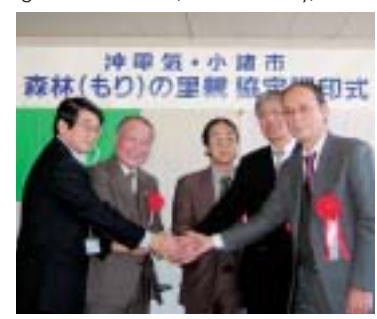
The signing ceremony for the "forest fostering" agreement

Saku Forest Association, and local residents. At the entrance of the forest, a sign will be erected, stating that the forest is fostered by the Oki Group. The Oki Group will also use this project as a forum for interaction with local residents, touching on regional culture and industry.