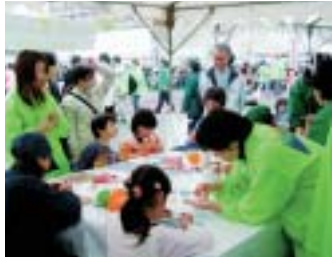
landcraft corner (bead work)

island. The purpose of the meetings, which are held twice annually, is to provide encouragement for island residents, who have shared the experience of a volcanic disaster. At the May 2004 meeting, the Oki Group presented a handcraft corner in cooperation with Every, a non-profit organization, and the Angel Foundation. In November, the Oki Group worked with the Angel Foundation and the International Take-Tonbo Association to present a booth where people learned how to make take-tonbo (bamboo dragonflies) by hand