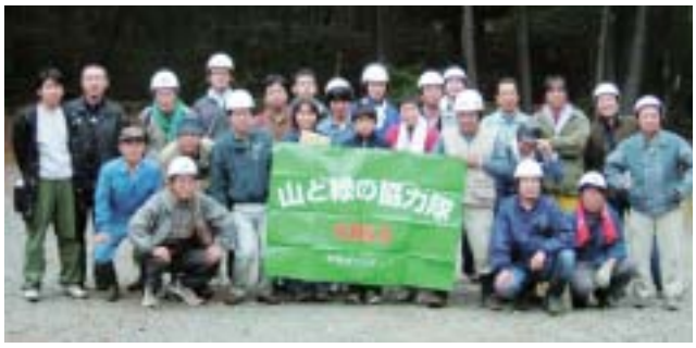
The Oki Cooperating Team for Mountains and Greenery