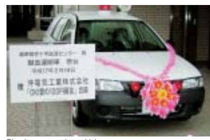
Blood transportation vehicle

blood transportation vehicle to the Red Cross blood center in Gifu Prefecture. It is used as an emergency vehicle for the transportation of blood from the center to hospitals and other locations.