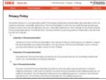
A web page for privacy policy

protection structure, the Chief Compliance Officer has ultimate responsibility for compliance throughout the Oki Group. Privacy managers have been appointed at the corporate level and in inhouse companies and group companies. These people form the organizational structure for the implementation of the basic policy through compliance with concrete privacy regulations and other related regulations. To ensure that policies are fully implemented in all departments and divisions, privacy protection has been also included in training for compliance managers. Oki also uses e-learning to educate individual employees about measures under the privacy law.