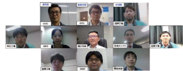
Production and Quality Reform Awards Presentation held remotely (December 2020)

OKI conducts group activities in which production base supervisors announce and award everyday improvement activities. A Groupwide “Production and Quality Reform Awards Presentation” is also held once a year to award and share effective initiatives and to promote cross-lateral development and succession.