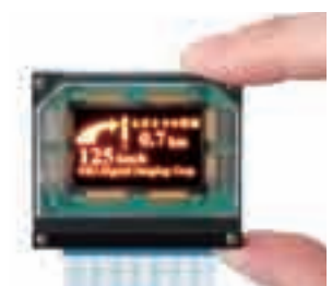
1.1 inch QVGA high brightness LED display

In November 2009, OKI Digital Imaging announced that it had succeeded in developing a 1.1 inch QVGA LED display with high luminance efficiency and low power consumption (one-tenth that of conventional LCDs). This innovative display uses the company's proprietary Epi Film Bonding technology (see Page 13) to mount thin-film LEDs onto a metal board with high reflection and radiation. As a result, the display achieves high luminance efficiency and high brightness with low power consumption. It also features the world's first 65-micrometer pitch between LED chips that allows high-definition images despite its size.