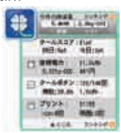
"Visualization" of energy consumed (the clover icon grows larger according to energy saved)

One of the "Green by IT" (see Page 12) energy-saving solutions, CoolClover controls different power settings for different IT devices such as PCs in an integrated way via networks, allows the visualization of power consumed by each device, and thus promotes the energy saving of IT devices. The center has introduced this system to approximately 1,500 PCs, and encouraged its employees to save energy. As a result, it achieved an average of 10% reduction of power consumed per month during a five-month period beginning from October 2009.