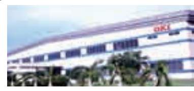
OKI Data Manufacturing (Thailand)

OKI Data Manufacturing (Thailand), the OKI Group's subsidiary manufacturing printers in Thailand, has made various energy saving