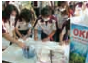
An experience-based education program

The OKI Group conducts an internal environmental audit for efficient and effective environmental management. In fiscal 2009, we established a new qualification criterion for internal environment auditors at each hierarchical level, and offer training programs for them.