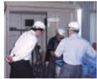
An on-site inspection of a commissioned disposer

In fiscal 2009, OKI, as part of its efforts for enhancing environmental compliance, revised its educational program for further improving the compliance of its disposal of used products as well as the operational procedure for it. The company also facilitated the appropriate disposal of used products, conducted on-site inspections of the commissioned disposers across Japan, and confirmed how used products had been stored or disposed of by actively utilizing the "Cross-jurisdictional Waste Treatment Manufacturer Scheme."*