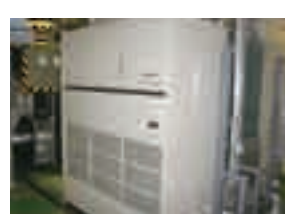
Packaged air conditioner installed at Shibaura site

OKI's Shibaura site replaced its long-used turbo refrigerator and boiler (used as a central-controlled air conditioning system) with a new air conditioning system that allows different operational settings for different rooms. This shift enables the site to reduce 70 tons of CO 2 emission every year.