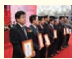
Ceremony celebrating partner certification for Green Energy Project

In June 2009, OKI Data announced that it had participated in the Green Energy Project as a partner company. The project, launched jointly by the China Environmental Protection Foundation (CEPF) and the China General Chamber of Commerce, aims at realizing an environmentally-friendly, resource-recycling society. The partner companies of the project are asked to contribute unused office equipment and IT devices as well as part of their profit to the CEPF, and thus support the foundation's activities to protect the environment. OKI Data is the only print manufacturer among the project's partners since its environmentally friendly products based on its LED technology and its serious commitment to environmental protection have been highly regarded in China.