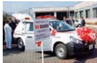
A car donated to the Japan Red Cross Kagawa Blood Center (February, 2008)