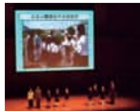
Volunteer workers from OKI broadcasting the event live

The OKI Group has supported the School Biotope* program* since 2001. On February 10, 2008, the leading event for the All-Japan School Biotope Contest was held at the National Olympic Memorial Youth Center in Tokyo under the auspices of the Ecosystem Conservation Society. The OKI Group broadcast the event live to the relevant schools and kindergartens in Hokkaido, Tokushima and Osaka using its video conferencing system Visual Nexus. Video recordings will be used to promote the school biotope program.