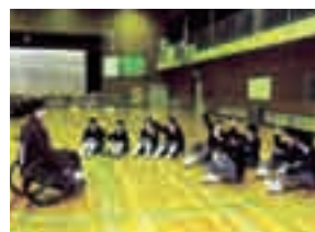
A lecture at a junior high school

The teleworking employees of OKI Workwel have given lectures on barrier-free designs and environments in local schools or other public facilities, and told their experiences as people with disabilities. In the fiscal year ended March 2008, one of them was invited by the NPO Career World and the Katsushika Council of Social Welfare to give lectures at elementary and junior high schools in Chiyoda-ku and Katsushika-ku, Tokyo. He told children about the inconvenience he had to suffer and the importance of barrier-free designs.