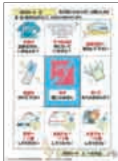
SOS cards are available at the AAJD's website http://www.1s.wisnet.ne.jp/

The SOS Cards were designed to help people who have difficulty expressing themselves in speech in the event of an emergency such as an accident or a disaster. With these cards, people with speech difficulty can communicate with others by simply pointing at or showing the card that best suits the situation they are in. OKI Consulting Solutions Co., Ltd. helped AAJD develop and assess the cards, while OKI Workwel designed the cards and uploaded them to AAJD's website.