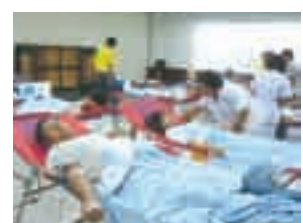
Employees of OKI Data Manufacturing Thailand donating their blood

In 1964, OKI launched Japan's first corporate blood drive. Since then, OKI has been active in promoting blood donation inside and outside Japan. OKI Data Manufacturing Thailand, a Thai subsidiary of OKI that manufactures printers, has carried out organizational blood donating periodically. In the fiscal year ended March 2008, approximately 290 employees donated their blood.