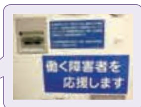
* SELP stands for the Support for Employment, Living and Participation (described as a vocational aid center in laws).