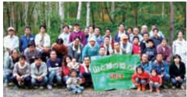
Tree thinning in a forest sponsored by OKI in Komoro

In the fiscal year ended March 2008, the brigade cut and thinned two forests associated with the OKI Group, one in Komoro (Nagano Prefecture) and the other in Kannonyama (Gunma) twice. The brigade also conducted thinning in Izu (Shizuoka). These activities were carried out in cooperation with the City of Komoro, Gunma Forest Management Department, the Green Earth Center (NPO) and other relevant organizations.