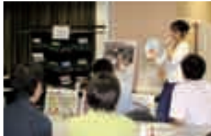
Books and picture-card show sets, published in Laos with financial assistance from the OKI 100 Yen Fund, presented at the event

The OKI Group, in cooperation with the NPO Action with Lao Children, sponsors an event to create picture books in the Lao language every year. During the event, participants added Lao translations to Japanese picture books. The event also features a quiz show through which the participants can deepen their knowledge of Lao culture. The participants in the 2007 event included not only employees of the OKI Group and their families but also students from Gakushuin Women's College who were going to visit Laos with Action with Lao Children. The 34 participants made 60 picture books during the event.