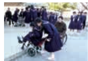
Students experiencing a wheelchair