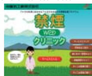
The intranet "Stop-Smoking Clinic" page

Subcommittees made up of representatives from administrative departments, health promotion centers and unions have been formed at in each work site and group company to ensure that activities produce the desired effects. These subcommittees share information through reports on their initiatives in a group newsletter called the Health Oki 21 News.