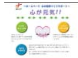
The mental health support section on the Health Oki 21 intranet page on the corporate intranet

Oki Group executives receive mental health training as part of efforts to encourage daily awareness and consideration in the workplace. In addition, a mental health support section has been set up on the Health Oki 21 intranet page. Employees can download stress-checking tools and receive information about self-control, and the relief and prevention of stress.