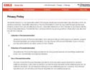
A web page for privacy policy

In August 2004, the Oki Group adopted a basic policy on the protection of personal information in preparation for compliance with a new privacy law* that took effect in April 2005. A privacy policy based on this policy has been published on Oki's website.