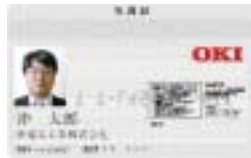
An Employee ID Card

The cards contain contactless IC chips that verify the identity of the holder using electronic certificates stored in the card's memory when they are connected to internal networks. Oki has further improved office security by installing a contactless key system to control facility access and egress.