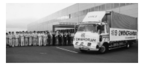
Ceremony marking first shipment of 16M DRAMs from Miyagi Oki Electric Plant

Prices for DRAMs turned soft from the end of 1995 due to an