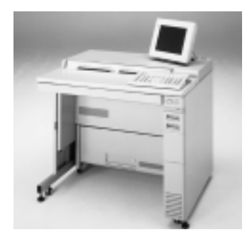
OKITAC-2500 general-purpose terminal for bank tellers

The branch integration system that formed the core of the OKITAC-2500 banking information system was aimed not only at handling account operations but also as a management system for handling all the business operations of a bank's sales branches. Four support systems comprised the overall system: accounting operations, information operations, administrative work, and system operation. Because the OKITAC-2500 was the first banking information system