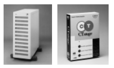
CTI system CTstage

The new strategy emphasized growth mainly through logic products based on silicon platform architecture (SPA). Its target was to increase the presence of Oki Electric worldwide and to promote a business structure capable of providing a stable level of profits. SPA refers to a platform with a four-layered structure. Device core tech-