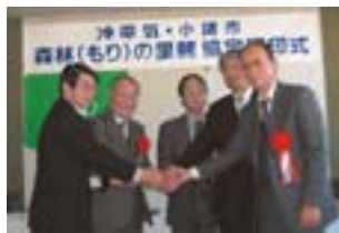
Forest Fostering Agreement signing ceremony

In January 2005, Oki signed a Forest Fostering Agreement with Komoro City in Nagano Prefecture. Each year Oki and the Oki 100-Yen Fund of Love (a charity organized by Oki Group employees) will, between them, donate 500,000 yen to the city. They will serve as "foster parents" for forest areas in Komoro City, including the Nomatori area, for a five-year period starting from February 1, 2005.