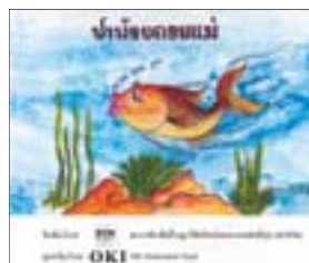
"The Little Fish Who Stayed Home"

Since the year ended March 2002, the Oki 100-Yen Fund of Love has supported publication of picture card books in the Laotian language in Laos. In the year ended March 2005, it helped to sponsor the publication of a picture card book, "The Little Fish