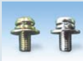
* Restriction of the Use of Certain Hazardous Substances in Electrical and Electronic Equipment

● Use of trivalent chromium screws: The Oki Group is switching to trivalent chromium instead of hexavalent chromium, the use of which is prohibited under the RoHS* Directive, as the material for screws used in its mechatronic products. Preparations are being made for the progressive introduction of the new screws at all production sites of the Group, starting in March 2005.