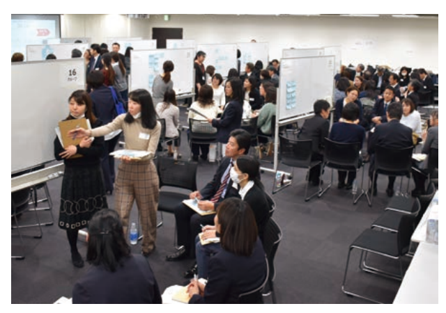
A seminar on promoting women's participation and advancement in the workplace (February, 2019)

Every year since fiscal year 2014, the OKI Group has been holding seminars on promoting women's participation and advancement in the workplace, bringing together top management, executives, managers and female employees of the OKI Group in their hundreds. In these seminars, top management talks directly about their expectations for female employees, showing their commitment towards promoting success for women in the workplace. These seminars, which include lectures and panel discussions by experts, and discussions among participants, including male employees, are an opportunity for female employees to gain more understanding about proactive career development. They have become established as a place for encouraging managers to recognize and practice the importance of managing such diverse talent.