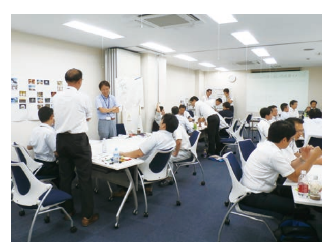
A workshop in action

In order to build a vibrant workplace culture amid a drastically changing and increasingly complex world where OKI is able to pave the way for new initiatives such as innovation creation and work style reforms without fear of failure, it is necessary to create a psychologically safe and secure atmosphere. In other words, we are working on a "say, can say, and listen" approach, where employees can talk with each other, where constructive criticism beyond personal interests and positions is accepted. To that end, in addition to training of individuals, we are conducting two-way communication trainings aimed at