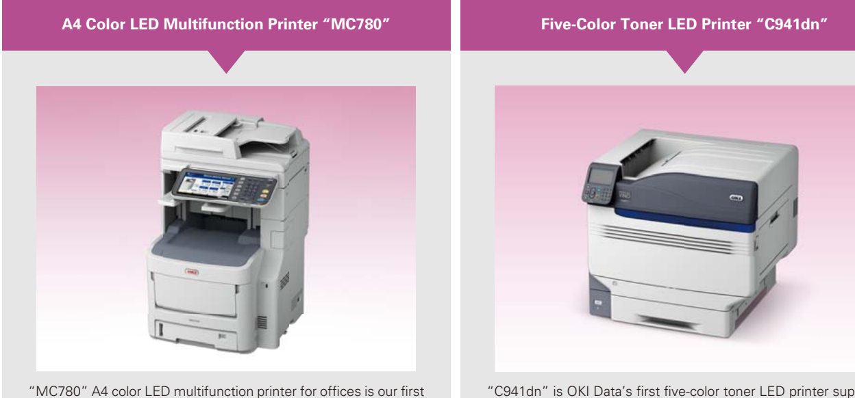
"C941dn" is OKI Data's first five-color toner LED printer supporting paper sizes up to A3+ for the professional market. With white and clear toner options, it can print on a range of media such as cardboard and transparent film.

OKI is committed to providing highly reliable LED printers to customers around the world in its quest to enhance business efficiency and create comfortable office environments.