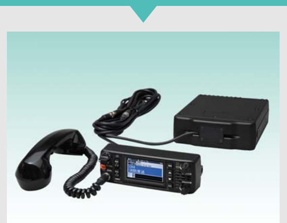
Towards the digitalization of the system in 2016, we will deploy car wireless systems and portable wireless devices at fire department headquarters nationwide and supply total support service from operations to maintenance.

For one test bed site prepared by the National Institute of Information and Communication Technology (NICT), we developed and delivered a river monitoring system that enables remote monitoring of river water levels using a wireless 920 MHz band multi-hop network to collect data via sensors for tracking water levels and rainfall amounts.