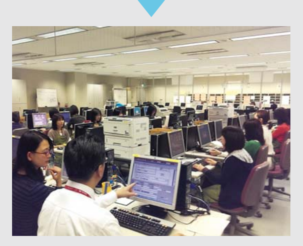
The Tokyo Tomin Bank, Limited has adopted the EXaaS foreign exchange OCR service. Without need of its own equipment, introduction of the cloud-computing service enables the bank to realize more efficient task-processing and operations in bank transfers.

EXaaS Foreign Exchange OCR Service is used at Tokyo Tomin Bank