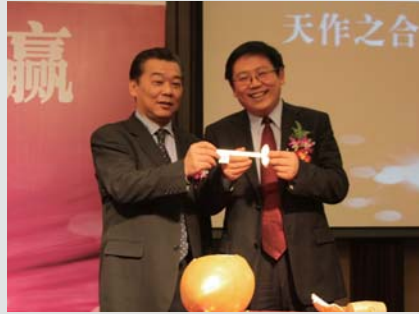
Press Conference to Announce a Partnership with Techhero Science and Technology

OKI Data announced the new COREFIDO brand for business-use monochrome, color and multi-functional printers. The main feature of COREFIDO brand products is the five-year free-of-charge warranty. Expanding coverage from the standard six months to five years, this warranty places the onus for repair expenses for breakdowns stemming from regular usage on OKI Data for this period. With this brand, OKI Data offers a new approach for using its standard and multi-functional printers where consumers pay only for the cost of the product, including the initial purchase price and regular part replacements, without worrying about repair expenses in the unlikely event of a breakdown.