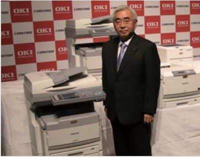
Announcement of the COREFIDO