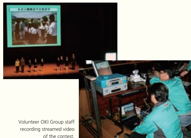
Volunteer OKI Group staff recording streamed video of the contest.

* Biotope: A habitat in which wild creatures live naturally.