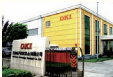
OKI Electric Technology (Kunshan) was newly consolidated.

With the aim of sharing information by integrating environmental management systems and achieving better efficiencies in business operations, the OKI Group is consolidating its environmental ISO certification program. During the fiscal year under review, OKI added 10 sites—including, for the first time, two Group company sites in China—completing the total consolidation of 42 sites throughout the Group.