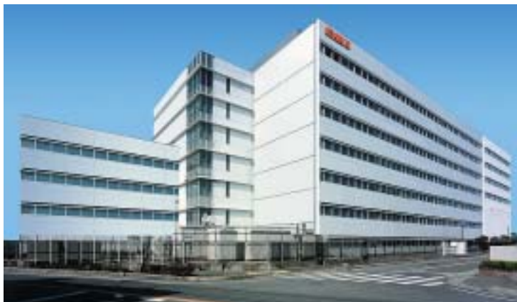
OKI System Center

And as a new effort, G.O. Food Service Co., Ltd. now uses rice that does not require washing in the employee canteen of the Center, realizing water savings of 1,200 m 3 per year.