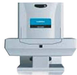
X-ray fluorescence spectrometer

The OKI group introduced X-ray fluorescence spectrometers at plants inside and outside of Japan to analyze the chemical substances contained in parts and materials during the acceptance inspection, etc.