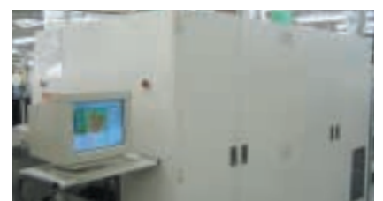
Production organization supporting lead-free solder (Soldering line with equipment to detect impurities)

Nagano Oki Electric Co., Ltd. is running a mass production system using lead-free solder, and for lead-free products, quality assurance is very important. This is where we install equipment to detect impurities in lead-free solder and take other action to improve the manufacturing process. We are working to stabilize the quality of lead-free products, and developed a “Lead-free EMS Business”.