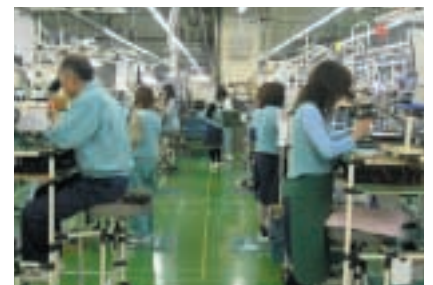
Eco-friendly production organization

The production service divisions (Honjo and Tomioka districts) are proceeding with the “Environmental EMS Business”, offering contract manufacturing services for electronic equipment specialized in eco-friendly products that do not contain hazardous chemical substances and comply with the RoHS Directive. Because the substances subject to the RoHS Directive used to be indispensable in conventional production processes, certain know-how is required to select substitution materials or to make the necessary design changes. The services take over all measures related to the RoHS Directive at one stop, from investigations on chemical substances contained up to research and selection of substitute parts, design, testing, prototyping and mass production.