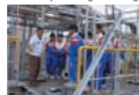
● Explanation of Environmental Equipment

Miyazaki Oki Electric Co., Ltd., a group company manufacturing semiconductors, conducted internships for local junior high and high school students as part of their local social contribution activities. In program seminars and visits of the production plants, Miyazaki Oki Electric explained its efforts, etc. for the environment to deepen the interest in activities to reduce environmental impact.