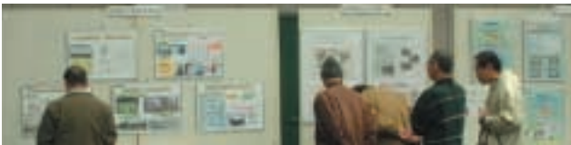
● Exhibition on Environmental Activities the Flea Market Venue

On a corner of the Flea market sponsored by Numazu City at the KIRAMESSE NUMAZU (multipurpose hall), our Numazu district, which is in charge of developing and manufacturing traffic and acoustic positioning systems, showed panels on their environmental activities.