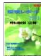
● Site Environmental Report of the Hachioji District (Example)