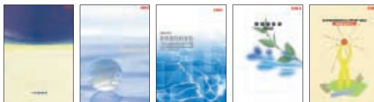
●Fiscal 1999 ●Fiscal 2000 ●Fiscal 2001 ●Fiscal 2002 ●Fiscal 2003

Every year, we release an Environmental Report in order to introduce Oki Electric's efforts for environmental conservation to people inside and outside of the company. A Japanese version and an English version provide mainly information on the results of Oki Electric's environmental conservation activities. The reports are also published on our website ( http://www.oki.com/en/eco/ ). Since the first edition in fiscal 1999, we have already released five Environmental Reports up to the edition for fiscal 2003.