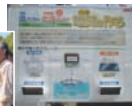
● Presentation Panel for Wind-power and Solar-power Generation