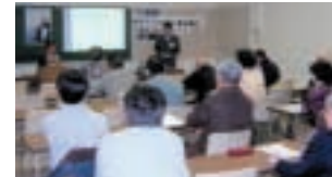
● Warabi Learning College

Our Warabi district, which is in charge of software development, introduced Oki Electric's and the Warabi district's environmental conservation efforts under the title "Town-making Through the Eyes of a Company" at the Warabi Learning College (lectures to foster trendsetters in town-making), to deepen the understanding of local residents, NPOs and others towards our environmental activities.