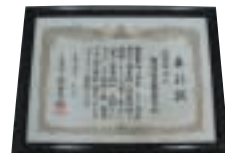
● Award Ceremony of the High Pressure Gas Safety Contest