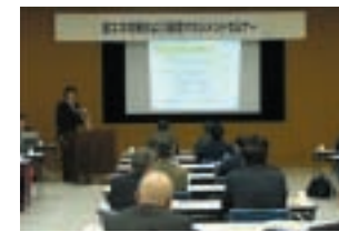
● Seminar on Measures to Save Energy and Environmental Management

On the "Seminar on Measures to Save Energy and Environmental Management" held by Tohoku Electric Power, Miyagi Oki Electric Co., Ltd., a group company manufacturing semiconductors, gave a speech titled "Total Environmental Engineering — Necessity and Efforts".