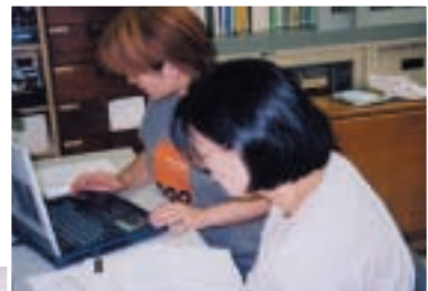
●PC Class at an Aid Institution

Oki Electric does not only offer a system for volunteer leave or a free volunteer insurance upon request, but also provides various volunteer information over the Intranet to support volunteer activities of employees. These activities are, for example, PC volunteer activities at social welfare institutions, participation in exchange event organized and held by the residents of Miyake Island evacuated in Tokyo, or participation in the “Children, Dreams, Future Festival” (Kodomo-yume-mirai fesutibaru).