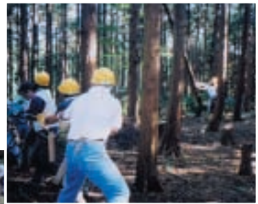
●Tree thinning in Naka Izu

In cooperation with environmental protection groups, our employees participate in volunteer activities (tree-thinning, twig-cutting, bottom weed cutting).