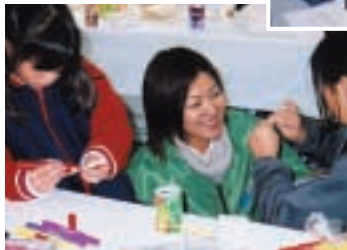
●Employees Participated in the Taketonbo Toy-Making Corner at the Seventh Meeting with Residents from Miyake Island.