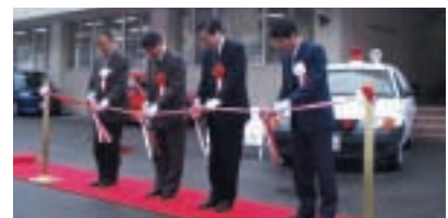
●Donation of a Car for Blood Transport (Red Cross Blood Center of Yamagata Prefecture)