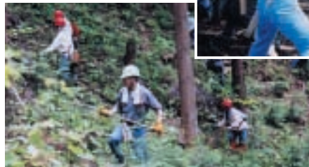
●Bottom-weed Cutting at Ura-Takao