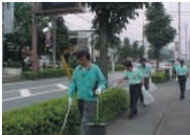
●Cleanup Campaign in the Kita-kanto (Tomioka) District

In Tohoku, Chubu, Chugoku, Shikoku, Kita-kanto, Numazu, Miyazaki and other districts, our employees, sometimes together with citizen groups, are working in cleanup campaigns of the community.