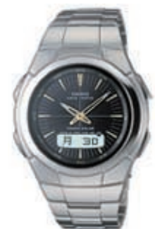
●A Radio Wave Solar Watch Containing the Commercialized LSIs