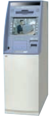
●ATM21S (Automated Teller Machine)

dispenser (470 mm). This compact size saves space, and contributes to reducing environmental impacts by saving resources and energy, also during transport.