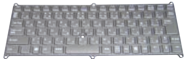
●Mobile PC Keyboard

We established a manufacturing process for mobile PC keyboards that are free of cadmium, a substance restricted in the RoHS directive. We also developed a technology to make thinner and lighter keyboards without any sacrifices in functionality. In the future, Oki will aim for overseas expansion, mainly to China, in the mobile PC keyboard field, where customers demand thinner, lighter and environmentally conscious products. Since this keyboard is a product that offers high quality while giving consideration to the environment, we even received a letter of appreciation from one of our customers.