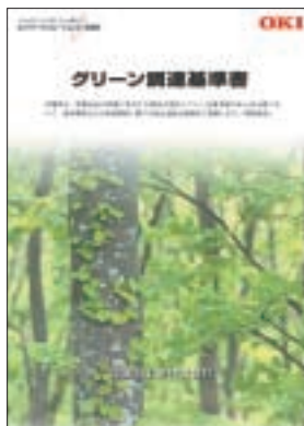
Green Procurement Standard

These documents are published on our website.