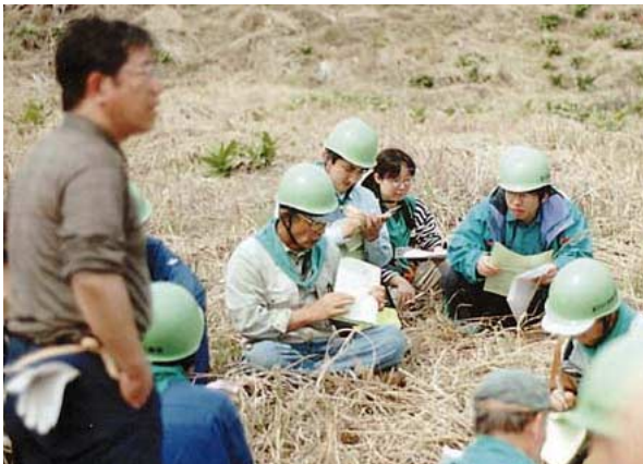
Meeting prior to the tree planting

The first "Fujisan no mori" regeneration activity, aimed at reforesting, tree thinning and observing nature, was performed by the Regeneration Activities Promotion Association (Secretariat: The Green Earth Center, a non-profit organization) in 1997. This was performed in cooperation with the Tokyo District Forest Office (Kanto Regional Forest Office, Forestry Agency, Ministry of Agriculture, Forestry and Fisheries) and the Managing Office of Agriculture, Forestry and Fisheries Planning (Department of Agriculture, Forestry and Fisheries, Prefectural Government of Shizuoka). Oki Electric employees, including core members from Oki Electric Numazu and Tokyo Districts, have participated as volunteers in a series of activities since the program's very beginning. The reforestation and tree-thinning activities, up until FY2000, were performed on no less than twelve occasions covering an area of approximately 6 ha.