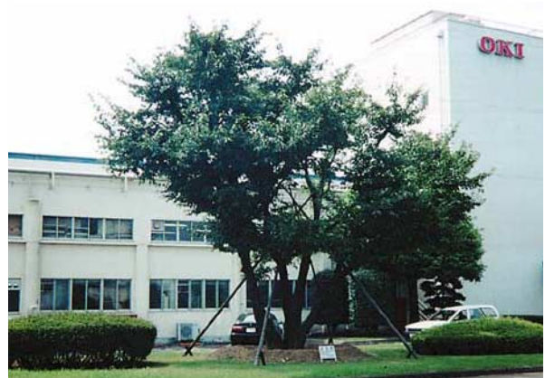
Reborn cherry trees (Honjo District)