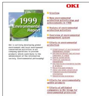
1999 Environmental Report

Both Japanese and English versions exist, and these describe the environmental policies of Oki, their program and activity plans and track records, as well as how the company is conducting environmental protection programs and activities.