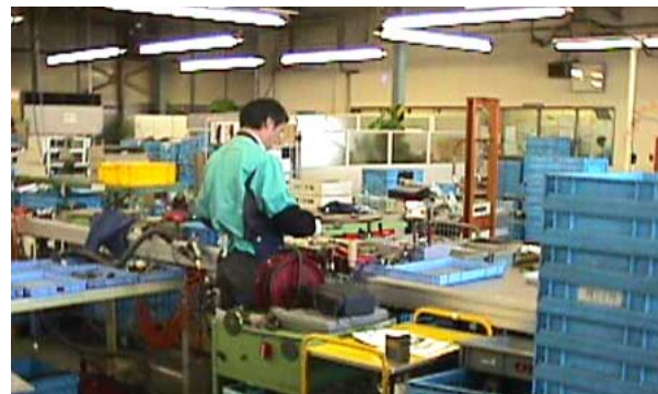
Recycling Center for used products