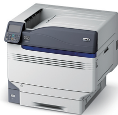
MICROLINE VINCI C941dn, the LED color printer capable of 5-color printing

In another core operation of OKI, printer operation, we will promote global penetration to the office solution (i.e. multi-functional devices) market and professional market with our high-value added products.