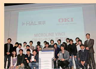
Production presentation and awards ceremony

OKI Data, a company engaging in the printer business, released "MICROLINE VINCI C941dn" in fiscal 2013, a highly regarded 5-colored printer for professional use capable of printing spot colors on a wide range of media. The commercial ad for this product was solicited through "MICROLINE VINCI CM Production Contest", held by OKI Data in January 2014 in collaboration with HAL Tokyo, an incorporated technical school. The participants of this contest submitted their works for judgement. 95 HAL Tokyo students in the IT and digital contents courses with aspirations to become future pioneers of the design industry, participated in the contest, and competed using their creativity.