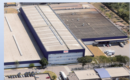
OKI Brazil: ATM business company in Brazil

In the ATM business, the core operation of OKI, we will cultivate new markets following Chinese, Russian and Indonesian markets by leveraging the advantage of our cash recycling ATMs. As a part of this activity, OKI has launched an ATM business company in Brazil in January 2014 as a strategic site for the entire Central and South American markets, while establishing an ATM sales subsidiary in India in April. We will continue to expand our line of products and services such as cash handling machines and deployment of maintenance services, along with the market expansion.