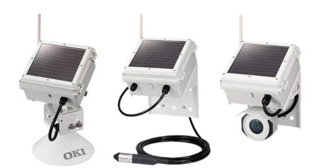
(Left) With Ultrasonic Water Level Gauge (Center) With Pressure Water Level Gauge (Right) With High-Sensitivity Camera