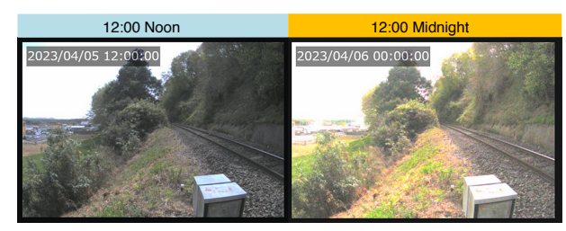
Figure 4. Example Images from Slope Monitoring

In such a situation, the implementation of a Zero-Energy Gateway equipped with a high-sensitivity camera will enable remote monitoring of the slope condition when heavy rain occurs. Figure 4 shows an example of images shot during slope monitoring. High-sensitivity photography takes clear photos even at midnight when there is no lighting and allows the slope condition to be remotely monitored regardless of the time of day.