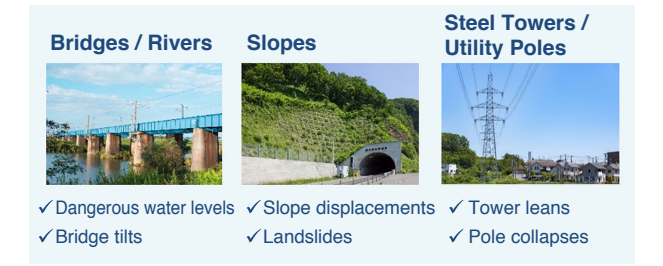
Figure 2 . Usage Scenarios

Infrastructure administrators of bridges, slopes, steel towers, etc. often visit sites to conduct inspections in order to confirm the integrity of infrastructures or assess the site situation in the event of a disaster. In these cases, issues arise such as the time required to travel to a site, the cost of inspection work, and the safety of personnel heading to the disaster site. With the use of OKI's system, the condition of infrastructures, river water levels, and on-site images can be monitored remotely. This will reduce the number of on-site inspections, thus improve efficiency of maintenance work and safety of personnel. Figure 2 shows the usage scenarios of the system.