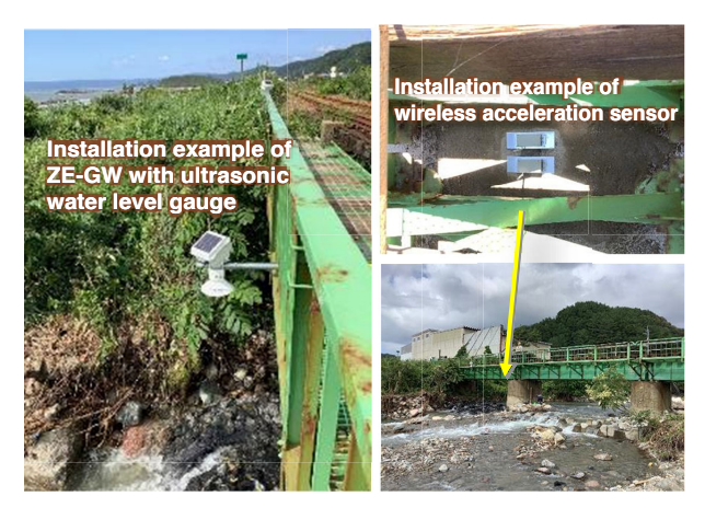
Figure 3. Installation on Railway Bridge

These issues can be solved with implementation of the Zero-Energy IoT Series. It will allow the infrastructure administrator to remotely assess the on-site situation, thereby improving work efficiency and ensuring safety.