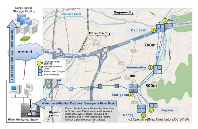
Figure 3. Configuration of System Installed at Sawayama River, Chikuma-city

OKI's river monitoring system was adopted for the mobile-wireless testbed of JOSE<sup>2</sup>), a large-scale open testbed headed by the National Institute of Information and Communications Technology (NICT). The system was installed at the Sawayama River in Chikuma-city. The configuration of the installed system is shown in Figure 3 .