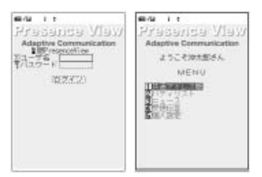
(1) Examples of login screen and main menu screen

Other than the FOMA dual terminals, software phones (Com@WILL®) are also terminals on which notifications and the display of presence information can be made. Besides the integrated management of presence information notified by FOMA dual terminals and software phones, it is also possible with PresenceView® to input one's own present location from a browser and notify other members. This makes it possible to verify the presence and absence as well as whereabouts of other members by using the i-mode browser installed in FOMA dual terminals even if outside the office and conduct communications in an efficient manner. Furthermore, it is possible to initiate a call to a person who is being referenced with regards to the