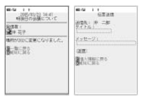
(3) Examples of message reception and message transmission

(2) Examples of presence display and personal information display