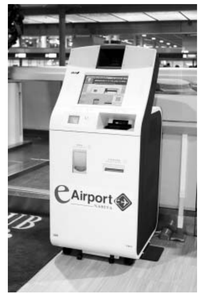
Phot. 1 Check-in terminal

When we meet people in our daily lives, we determine who they are by looking at their faces. Similarly, attendants at the airport can readily verify facial images without having to be aware of any special operations in order to verify individual identities and because it is very convenient for the traveler there is a prospect for the practical application of the "face" authentication technology.