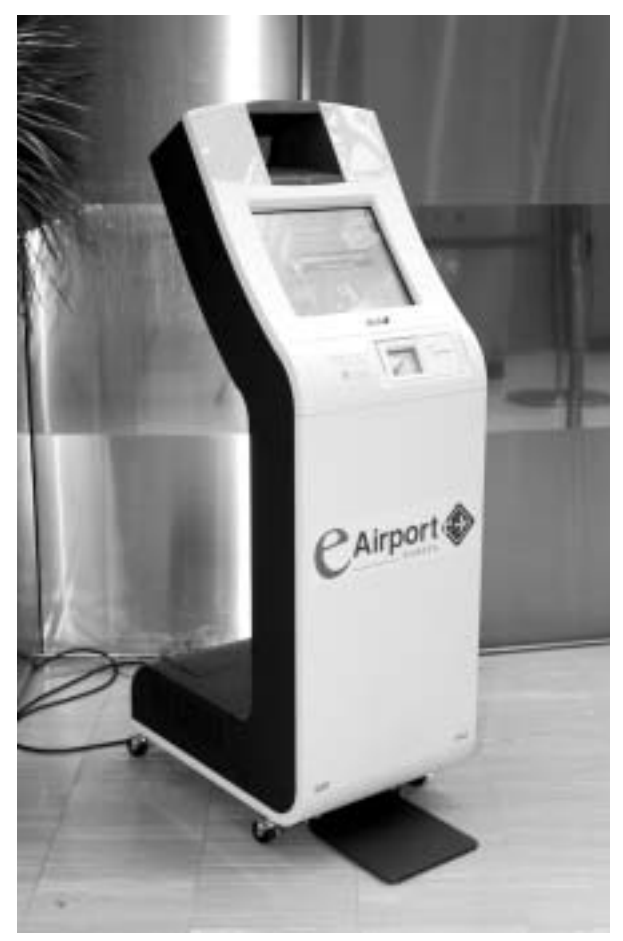
Phot. 2 Boarding gate terminal

Since the experiment was administered in such a way so that the check-in operation was basically done by the participants themselves, obtaining good facial information for the registration of facial information was an important point.