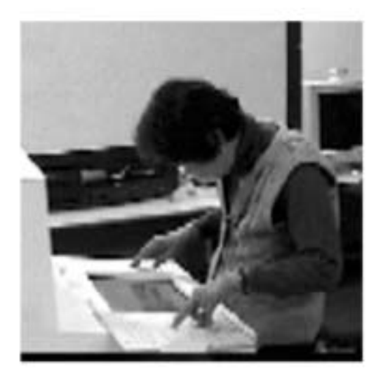
Phot. 1 A scene of a usability test

An example of a usability test, as described above, was used to study the issues with ATMs for the elderly.