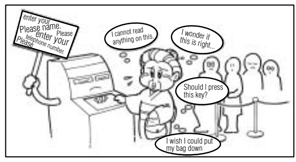
Fig. 1 An elderly person experiencing difficulties with an ATM

the operations required by users have become much more complex and manufacturers are striving to implement a variety of improvements, with the further incorporation of multifunction operations to these pieces of equipment, such as the addition of a lottery ticket purchasing function along with existing fund transfer and deposit functions.