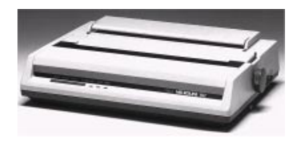
Photograph 2 New Microline ML182

In the direct drive for the self-running head carriage in the main scanning direction, we