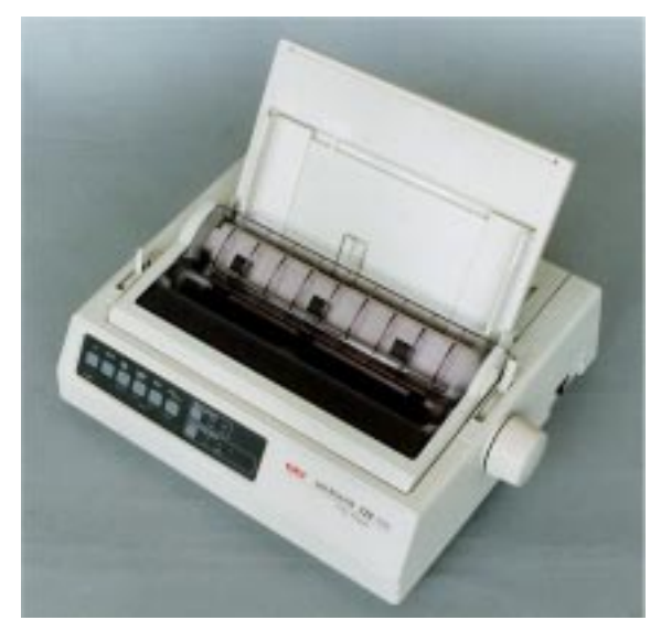
Photograph 3 Microline 320

The full moulding case structure used in the 300 series, and the vertical mounting of the control PCB, really made it hard to pass FCC regulation. Seeing as the 9-pin and 24-pin models were being developed simultaneously, at first, we worked on them jointly in the shielded room. However, in the end, this was not