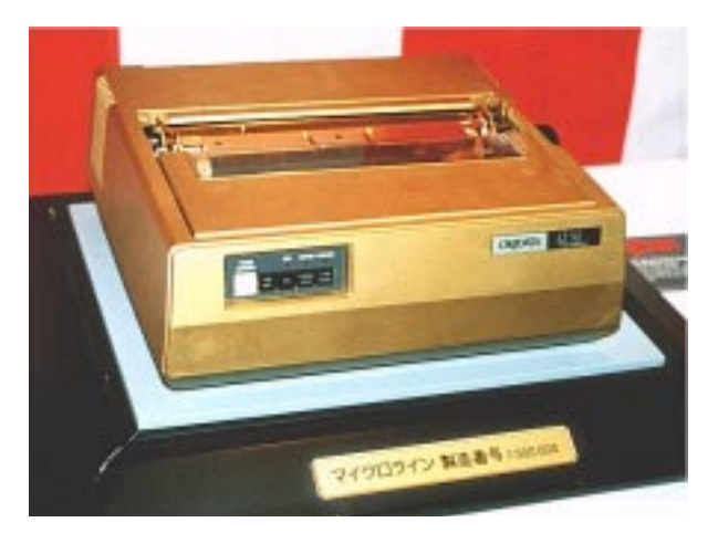
Photograph 1 Old Microline ML92 (Gold plated to commemorate one million printers manufactured)

1981 saw the launch of the ML82A (A4) and ML83A (A3) printers, which would later come to be known as "Old Microline". These printers had a really solid build,