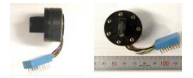
Photograph 5 Compact wire dot head

At the time, two different systems were used for wire dot heads: a clapper system where the wires are projected by the end of a movable member, using an electromagnet; and a spring charging system where springs are released by using an electromagnet to cancel out the attraction of a permanent magnet, thereby projecting the wires on the end of springs. We decided to avoid the clapper system, because of our