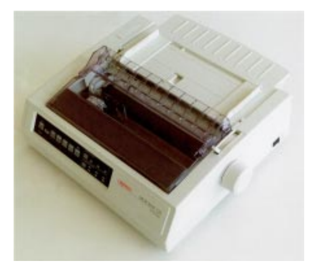
Photograph 4 Microline 520

The 500 series also involved further improvements of the paper feed system used in the 300 series, with